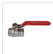
BRASS BALL VALVE 25MM