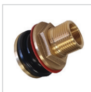
BRASS OUTLET 25MM