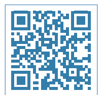
SIGN UP TO MONTHLY SPECIAL ALERTS