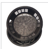
LEAF STRAINER WITH LIGHT GUARD 400MM