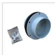
OVERFLOW OUTLET KIT 90MM