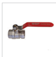
BRASS BALL VALVE 25MM